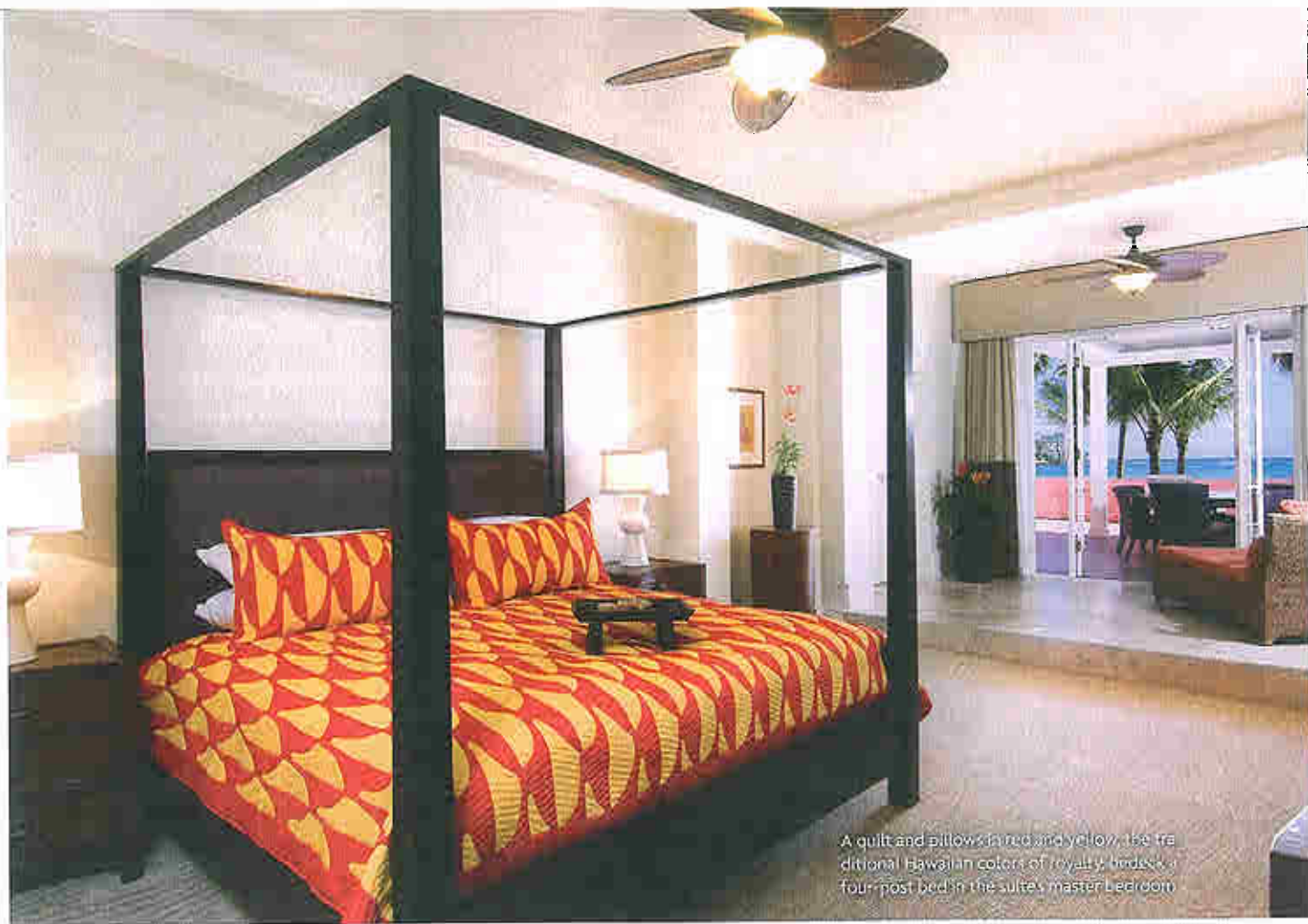
A quilt and pillows in red and yellow, the traditional Hawaiian colors of royalty, bedeck a four-post bed in the suite's master bedroom.

In fact, as a little girl I was fascinated by my dad's stories of those days, as he, like many young men, joined the U.S. Navy during the war and was sent to the South Pacific. He spoke of his stay in the Pink Palace, recalling how "they rolled up the rugs and put away all the knickknacks" so the sailors could stay there. When as an adult I moved to the Islands, Dad visited here only once more before he passed away, and we strolled through the hotel lobby together while he reminisced.