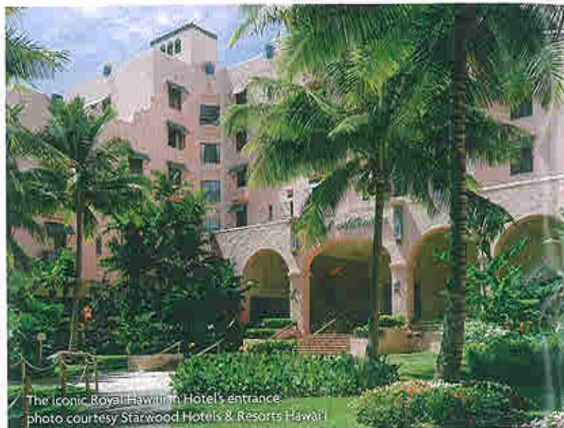
The iconic Royal Hawaiian Hotel's entrance

But when the Japanese bombed Pearl Harbor in 1941, ushering the United States into World War II, the six-story, 400-room grand hotel was leased exclusively to the U.S. Navy as a rest and recreation center for the Pacific Fleet.