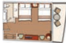
Resort/Partial Ocean/Ocean View