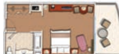
Deluxe Ocean Front