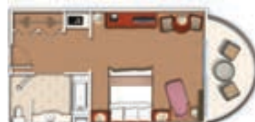
Deluxe Ocean View